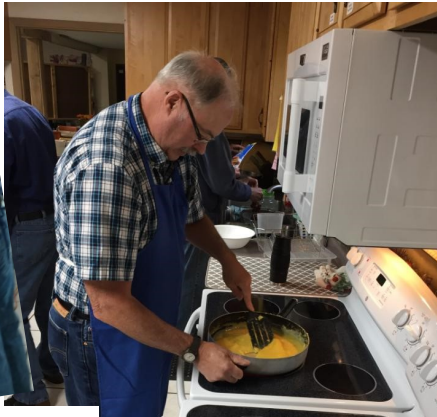
Rally Sunday kicked off with a Pancake Breakfast that the Men of Trinity helped prepare!